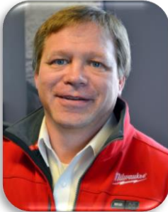
Duane DuRay Sawyer International Airport