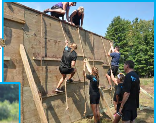
There wasn't a back-up this year at the climbing wall, thanks to Auto Value of Ishpeming! We had three, which helped keep the race moving!