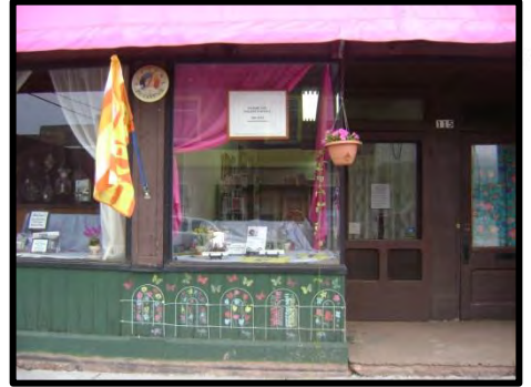
Above: The store front of Picture This Art Studio & Gallery, located at 115 Cleveland Ave., Ishpeming. Below: A picture of the inside of the gallery, which is open to the public.

Congratulations to Corbin and Picture this Art Studio & Gallery for being this month's business feature!