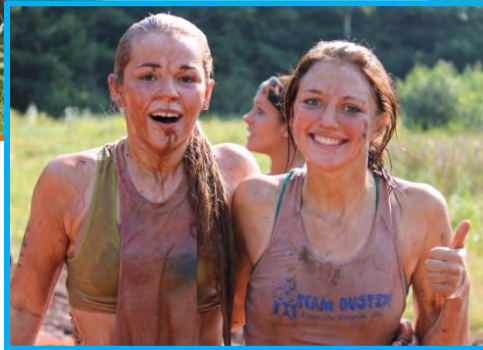
These girls were definitely having FUN during the Bell Hospital Fun Run!