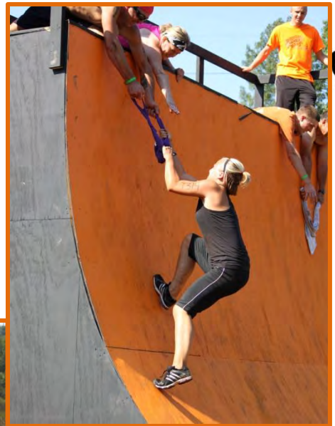
The St. Onge Cliff Hanger was by far, the toughest obstacle. It was fun to watch people attempt the quarter pipe, and watch teams help each other up!