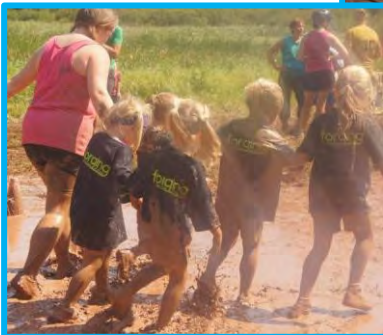
Over 200 kids participated in the Crossfit 906 Kids' Run. And they had a blast!