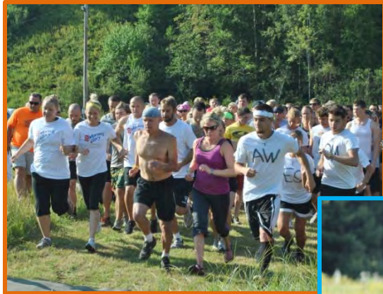
The beginning of the A. Lindberg & Sons Competitive Run: everyone was anxious to start!

1088: This is the final number of men, women and children registered after all was said and done at this year's Suicide Hill Mud Plunge. We would not have been able to make the event a success without our sponsors and volunteers, so thank you to everyone who donated their time and money. Check out these great action shots of the day below, taken by Alisha Ann Photography, a fellow Chamber member and our event photographer.