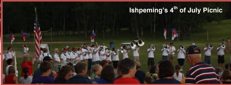
Ishpeming's 4 th of July Picnic