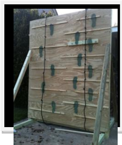
One of the many great obstacles! (on right)