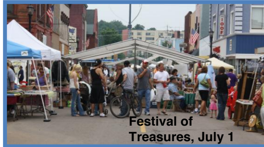
Festival of Treasures, July 1