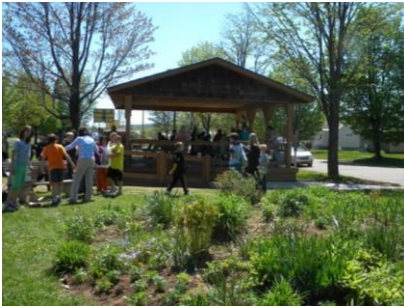
Fifth graders from Lakeview Elementary participate in the 2 nd annual Marigold Mania at Miner's Park in Negaunee as part of a volunteer encouragement activity with the Negaunee Beautification Committee.