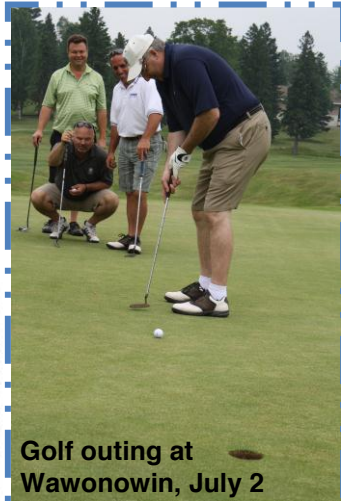
Golf outing at Wawonowin, July 2