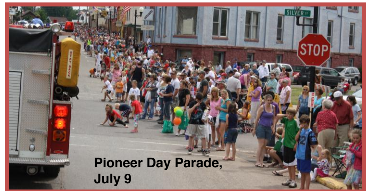
Pioneer Day Parade, July 9