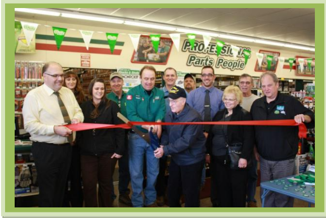
O' Reilly Auto Parts celebrated their ribbon cutting ceremony on April 17 th .

The GINCC has been busy kicking off summer with ribbon cuttings and grand openings! Congratulations to all of you, and welcome to the West End, new businesses!