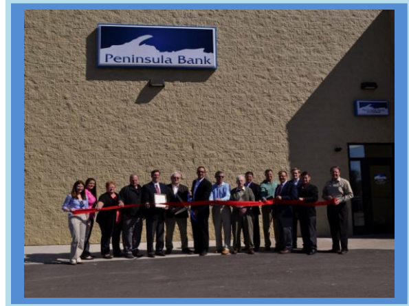
Peninsula Bank, located inside Negaunee's newly renovated Super One, celebrated their ribbon cutting ceremony May 7 th .