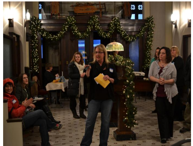
The Negaunee Irontown Association Held its Annual Membership Drive And Business After Hours on February 12, 2014.