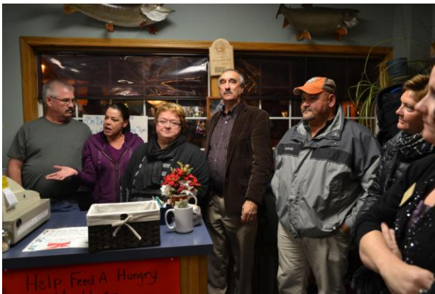
Buck's Restaurant, Central U.P. Insurance Agency, and Wilderness Sports held a joint Business After Hours on December 19, 2013.