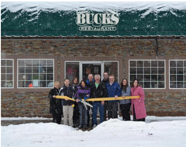
Buck's Restaurant in downtown Ishpeming celebrated a snowy Ribbon Cutting on January 30, 2014.