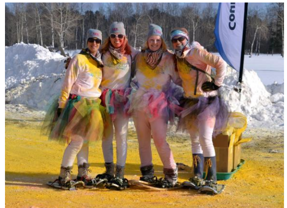
The second annual Arctic Blast Color Dash snowshoe race took place January 18, 2014.